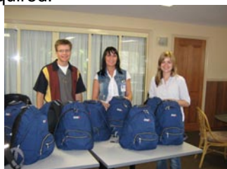
Homeless Health Outreach Team Collecting the Backpacks

The pack and the items in them cost approximately $70 and I would like to thank the supporters who have donated money towards them. Any additional financial support would be fantastic, so we can supply more packs when required.